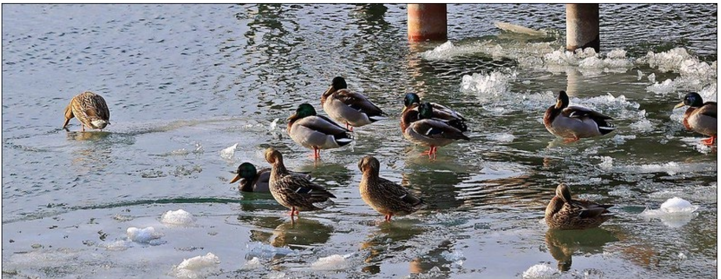
'Just ducky'

For more information: Visit the Health Research BC webpage